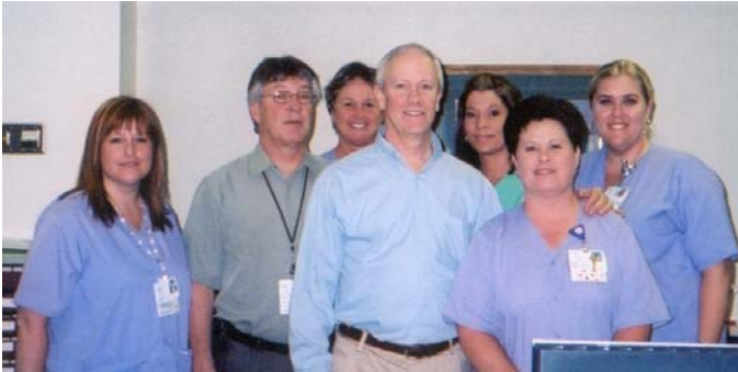
Congressman Jerry McNERney stops in OB