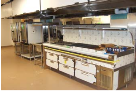
New stove and ovens

A BIWEEKLY NEWSLETTER FOR PHYSICIANS, EMPLOYEES AND VOLUNTEERS FOCUSING ON THE HOSPITAL'S MISSION OF PROVIDING QUALITY CARE AND IMPROVING THE QUALITY OF LIFE TO THOSE WE SERVE