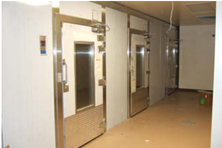
Walk-in refrigerators and freezers