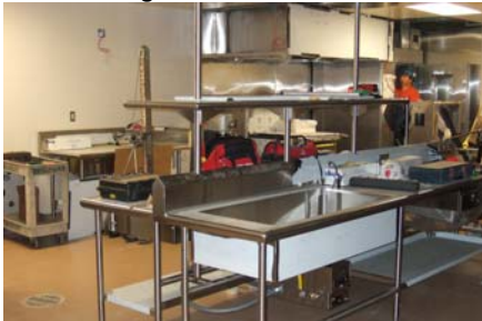
Food prep area